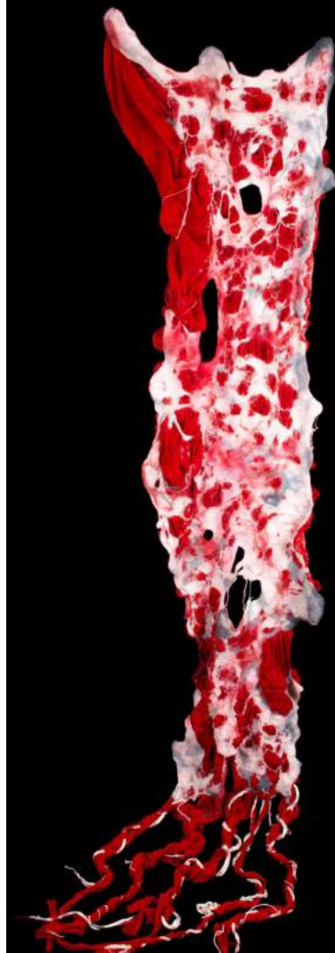
Pathways 2022 Wet felted wool on reclaimed fabric, thread, rope 325 x 69 x 8 cm