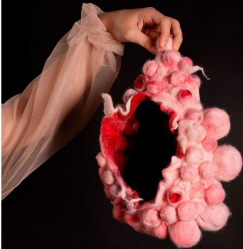
Hold me 2020 Wet-felted wool 37 x 25 cm