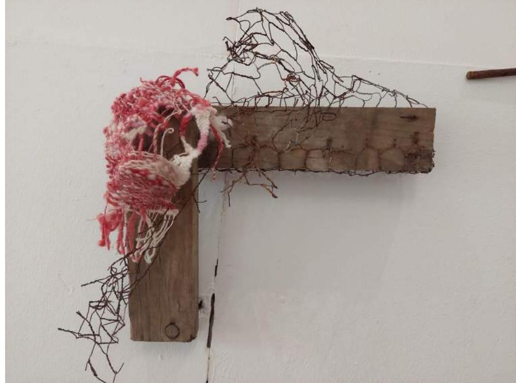
Weaving breath Hand-spun wool, found object