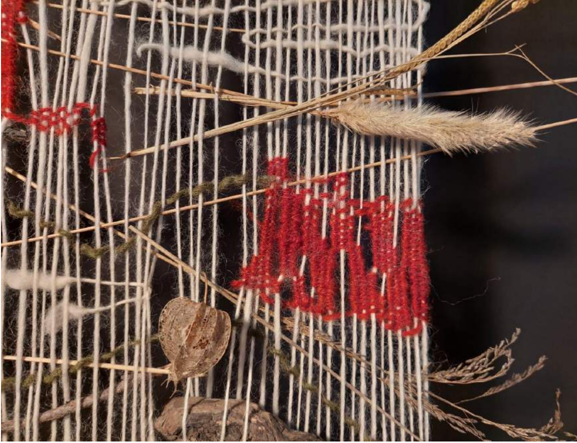
Rhythm in tension, Hand-spun wool, found objects, time