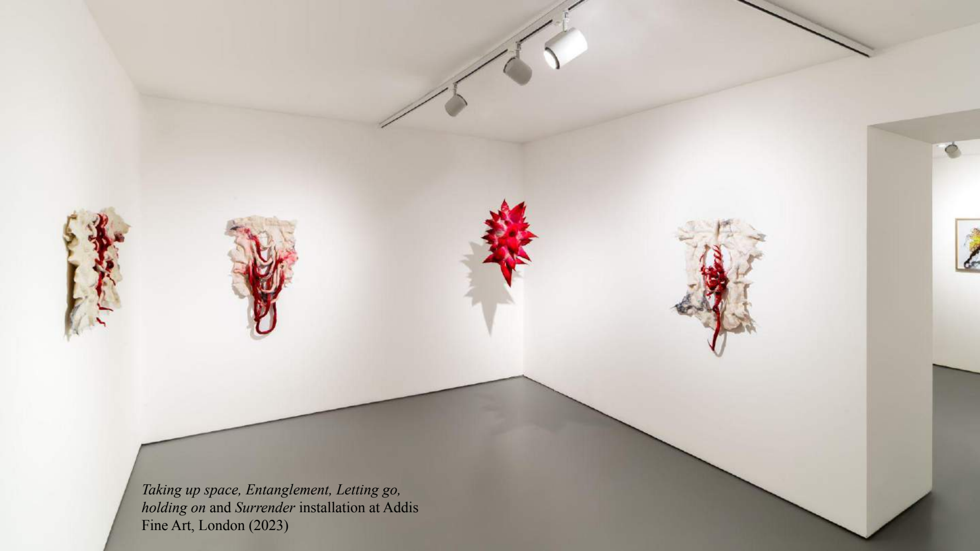
Taking up space, Entanglement, Letting go, holding on and Surrender installation at Addis Fine Art, London (2023)