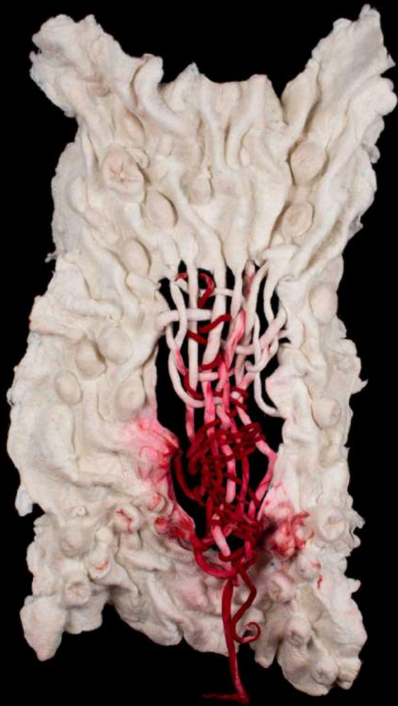
Unravel, hold, repeat 2022 Wet-felted wool, wire 110 x 66 x 7.5 cm