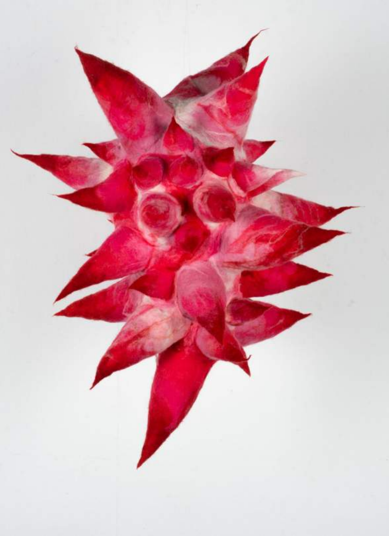
Taking up space 2023 Merino wool and stuffing 61 x 75 x 51 cm