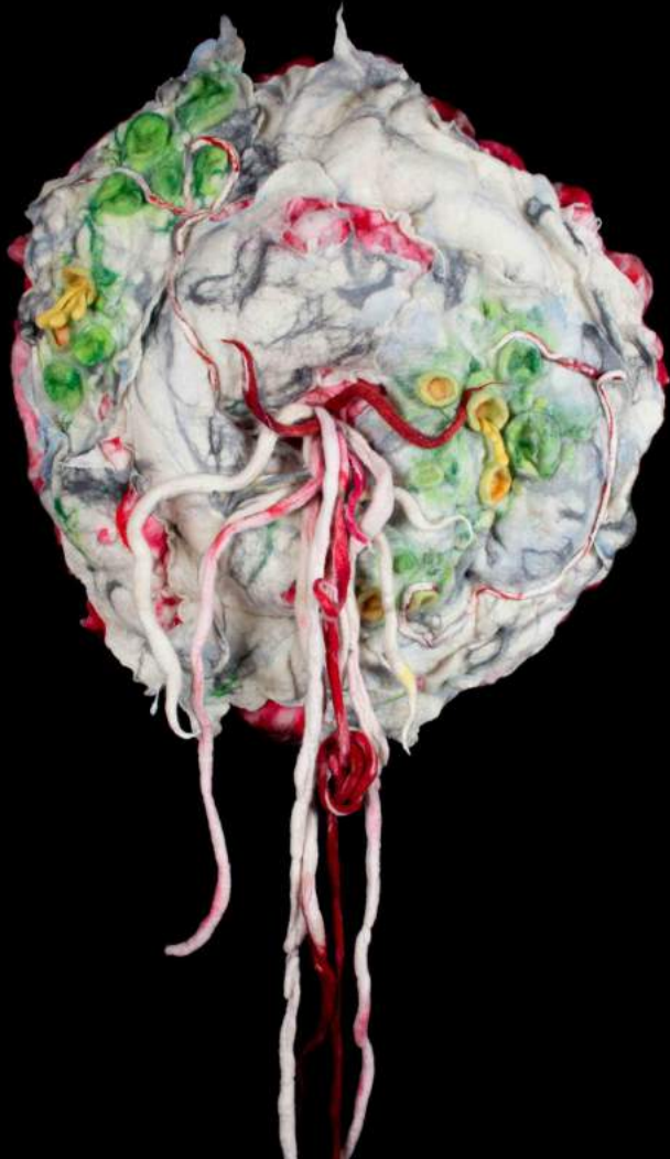
What we hold, 2022 Wet-felted wool, stuffing, foam, canvas 211 x 78 x 18 cm