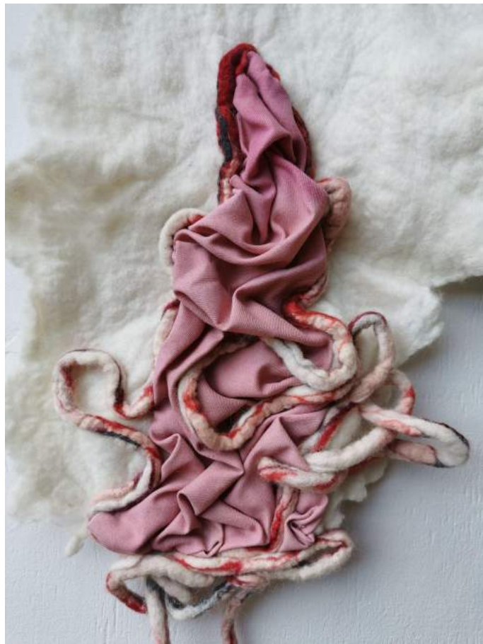
Comforting discomfort 1 , 2021 Wet felted wool, hand dyed fabric, thread 30 x 77 cm