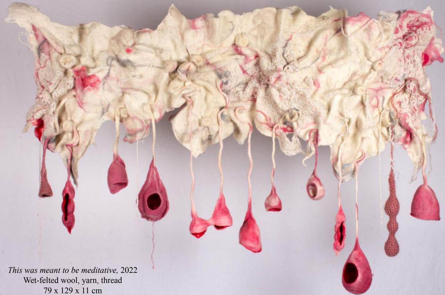
This was meant to be meditative, 2022 Wet-felted wool, yarn, thread 79 x 129 x 11 cm